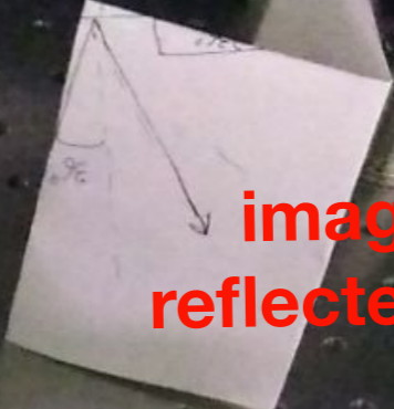
image reflected IR